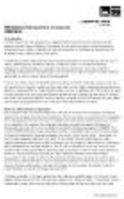
Digital Record 'PAD_Overview_Feb2007' (GB3451/OC/D/1701/574/10)