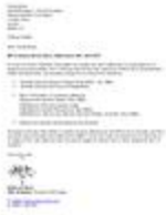
Digital record 'Letter_FinellaBoyle_Esmee' (GB3451/OC/D/1701/574/11)