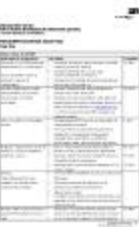
Digital Record 'PAD_WorkPlan_Mar06' (GB3451/OC/D/1701/574/7)