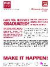
Digital Record 'PAD_Advert_colour' (GB3451/OC/D/1701/574/25)