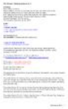
Digital Record 'PADScheme_COPY2' (GB3451/OC/D/1701/574/44)