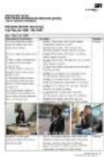
Digital Record 'PAD_ProgressReport_Mar07' (GB3451/OC/D/1701/574/14)