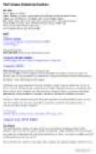
Digital record 'PADScheme_COPY_FINAL' (GB3451/OC/D/1701/574/41)