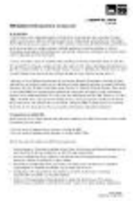
Digital Record 'PAD_Scheme_BusinessPlan_2007_08' (GB3451/OC/D/1701/574/19)