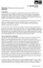
'PAD_Overview_Nov2005' PAD scheme overview (GB3451/OC/D/1701/574/6)