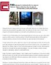
Digital record 'PADLaunch_PressRelease' (GB3451/OC/D/1701/574/29)