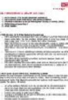
Digital Record 'PADScheme_Update_Jul2006' (GB3451/OC/D/1701/574/8)