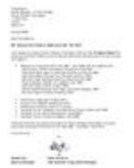
Digital record 'Letter_FinellaBoyle_Jan08' (GB3451/OC/D/1701/574/16)