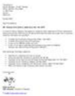
Digital Record 'Letter_FinellaBoyle_Apr07' (GB3451/OC/D/1701/574/15)