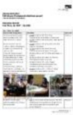
Digital Record 'PAD_ProgressReport_Jan08' (GB3451/OC/D/1701/574/17)