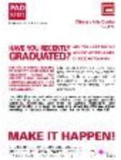
Digital Record 'PAD_Advert_colour_II' (GB3451/OC/D/1701/574/27)