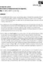
Digital Record 'PAD_Scheme_Summary_Sep06' (GB3451/OC/D/1701/574/9)