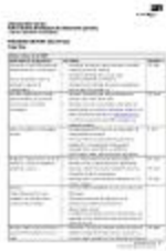
Digital record 'PAD_ProgressReport_Mar06' (GB3451/OC/D/1701/574/12)