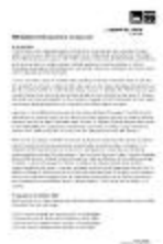
Digital record 'PAD_Scheme_BusinessPlan' (GB3451/OC/D/1701/574/18)