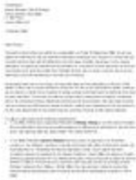
Digital File: 'Letter_FinellaBoyle_Oct06' (GB3451/OC/D/1701/574/13)