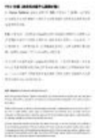
Digital Record 'PAD_ChineseTranslation_Nov07' (GB3451/OC/D/1701/574/43)