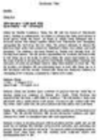
Digital File: Business Plan 2010.doc [Breathe residency] (GB3451/OC/D/2101/409)