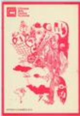
Programme 'Chinese Arts Centre Spring & Summer 2010' (GB3451/OC/M/2/3/15)