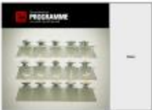
Digital File '493881 PROOF[1].pdf' (GB3451/OC/D/1801/192)