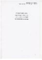
'Chinese Arts Centre Limited Trustees' report and accounts' (2006) (GB3451/OC/1/2/8)