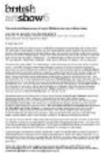
Digital File 'BAS6 regional_2_DRAFT.doc' (GB3451/OC/D/1801/197)