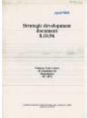
Chinese Art Centre 'Strategic Development Document' (GB3451/OC/A/2/17)