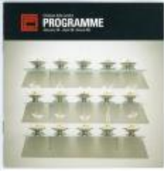
Brochure 'Chinese Arts Centre Programme January 06 - April 06 [Issue 06]' (GB3451/OC/M/2/3/7)