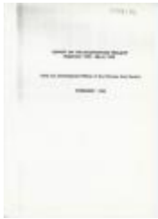
'Report on the Intervention Project, September 1995-March 1996' (GB3451/OC/A/2/23)