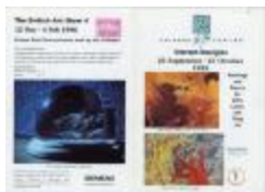
Chinese Arts Centre programme, Sep 1995-Mar 1996 (GB3451/OC/M/2/1/1)