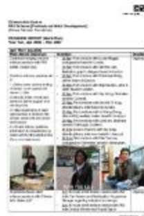
Digital Record 'PAD_ProgressReport_Mar07' (GB3451/OC/D/1701/574/14)