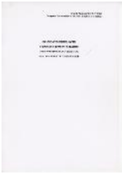
Trustees' report and accounts for the year ended 31 Mar 2008 (GB3451/OC/1/2/10)