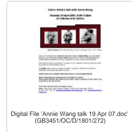
Digital File 'Annie Wang talk 19 Apr 07.doc' (GB3451/OC/D/1801/272)