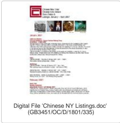
Digital File 'Chinese NY Listings.doc' (GB3451/OC/D/1801/335)