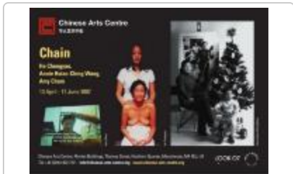
Digital File '629484 Dp.pdf' (GB3451/OC/D/1801/268)