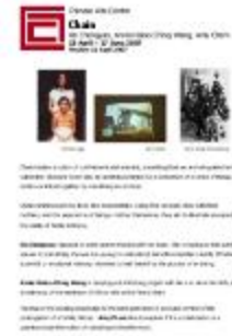
Digital File 'Chain pr 1.doc' (GB3451/OC/D/1801/267)