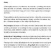
Digital File 'chain final programme x2.doc' (GB3451/OC/D/1801/266)