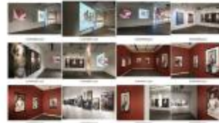
'Chain' CD (GB3451/OC/6/3/16/2)