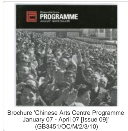
Brochure 'Chinese Arts Centre Programme January 07 - April 07 [Issue 09]' (GB3451/OC/M/2/3/10)