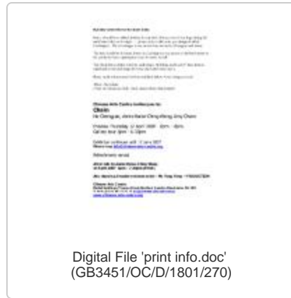
Digital File 'print info.doc' (GB3451/OC/D/1801/270)