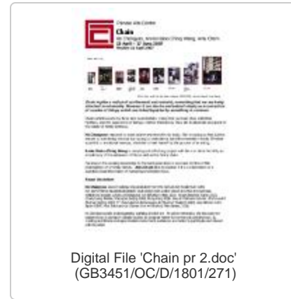
Digital File 'Chain pr 2.doc' (GB3451/OC/D/1801/271)