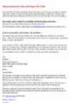
Digital File 'Copy for joint email.doc' (GB3451/OC/D/1801/336)