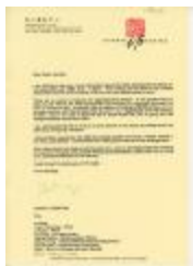
Letter re. Chinese Art Centre Development meeting (GB3451/OC/A/2/2)