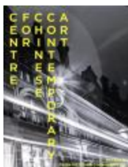
CFCCA, 30 Years of Centre for Chinese Contemporary Art (2016: Manchester) (S4.021)