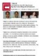
Digital File 'twelve.doc' (GB3451/OC/D/1801/178)