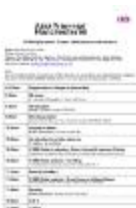
Digital File 'SYMPOSIUM TIMETABLE-1.doc' (GB3451/OC/D/1801/773)