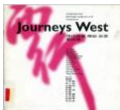
Lim, Jessie "Journeys West: contemporary paintings sculpture and installation", England, 1995 (S4.013)