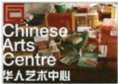
Chinese Arts Centre programme Oct 2008 - Feb 2009 (GB3451/OC/M/2/3/12)