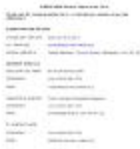
Digital File 'CHINA NOW Partner Information Form (5).doc' (GB3451/OC/D/1801/782)