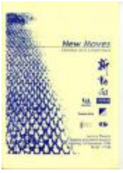
Fusion Arts, New Moves: Chinese Arts Conference (UK: 1999) (S4.023)