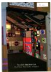
Unit 2 Gallery, Access Permitted, (2006: United Kingdom) (P5.031)