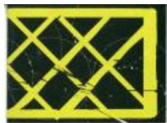
Chinese Arts Centre, (1986-), Arrivals and Departures, 2010, UK (S4.006)