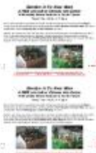
Digital File 'Rushton & Tyman 7 Dec 06 poster.doc' (GB3451/OC/D/1801/256)