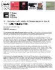
Digital File '21 - Discussions with artists of Chinese descent.doc' (GB3451/OC/D/1801/879)