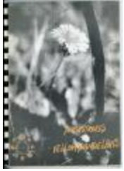
Chan, Mei-Ch, Brushstrokes, Yellow Dandelions, (UK: 1994) (S4.024)