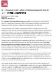
Digital File '21 - Discussions with artists of Chinese descent POST.doc' (GB3451/OC/D/1801/878)